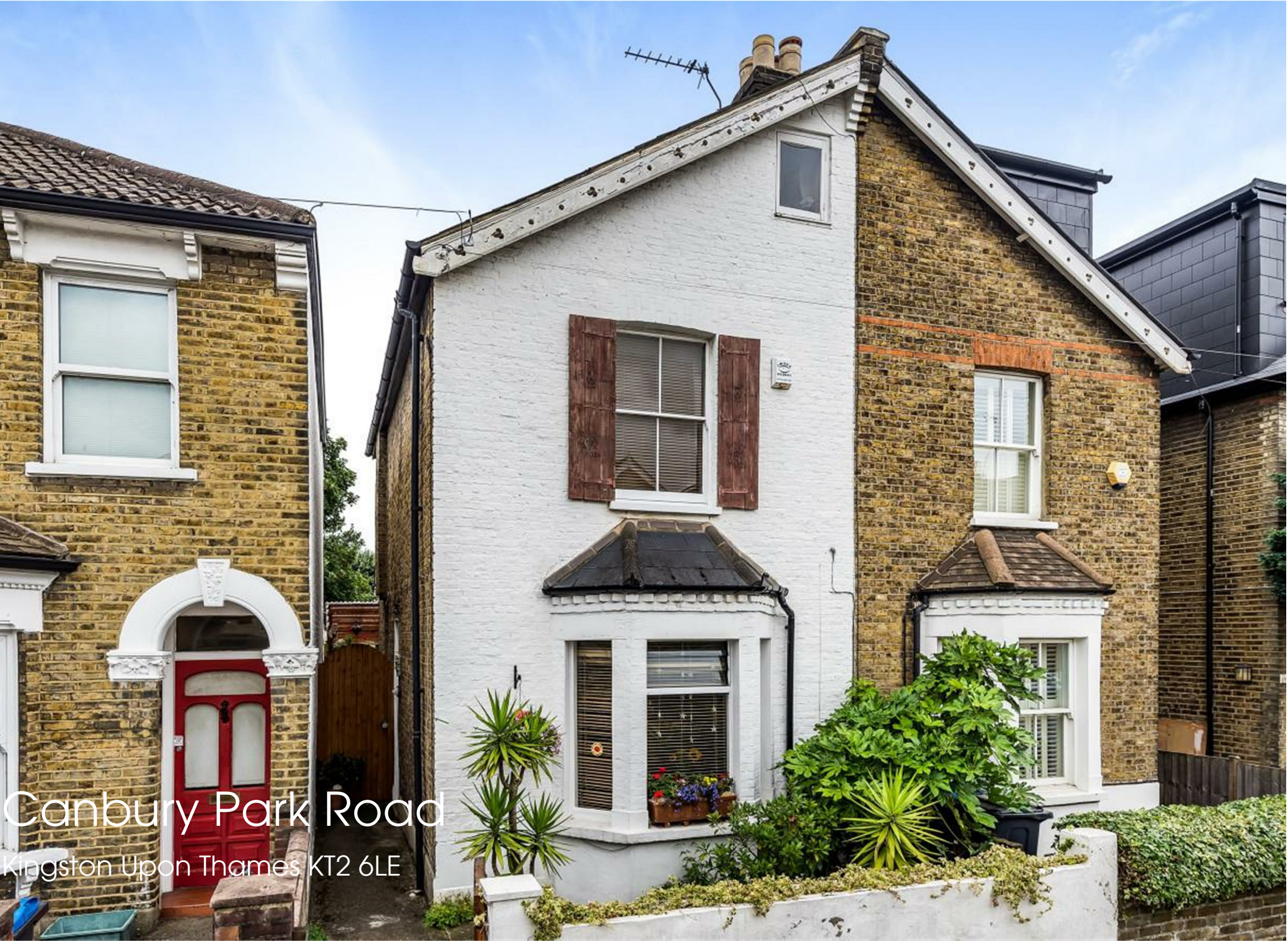
Canbury Park Road Kingston Upon Thames KT2 6LE